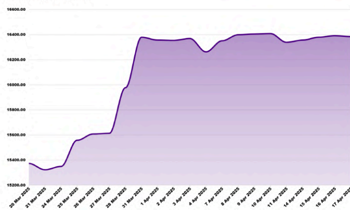
LASI Chart | Closing Price