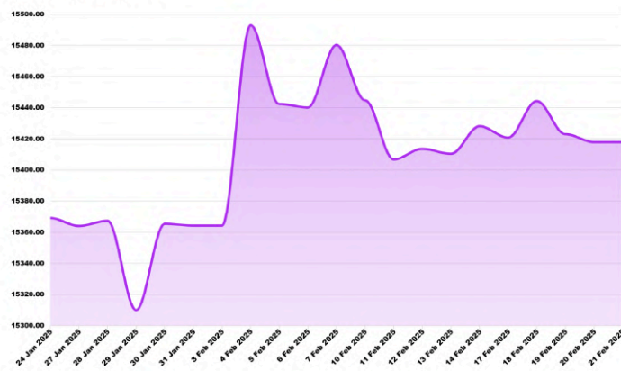
LASI Chart | Closing Price